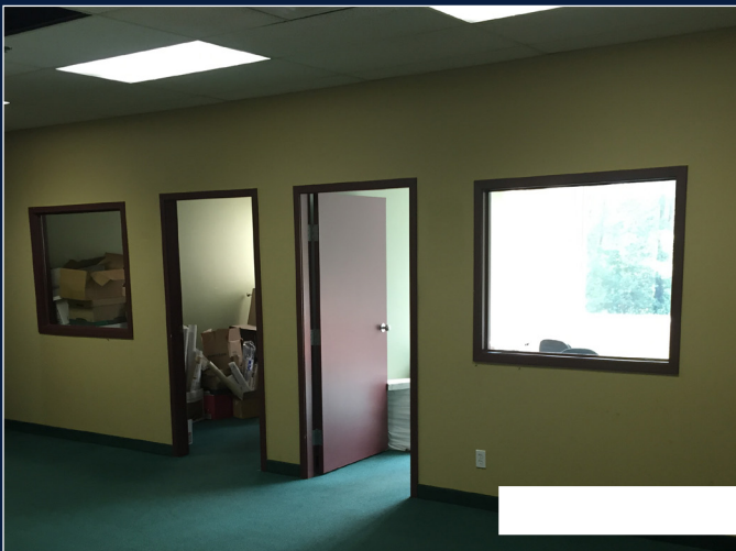
OPTIONAL UPSTAIRS OFFICE