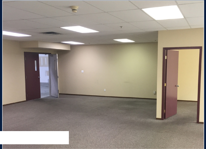
MAIN FLOOR OFFICE