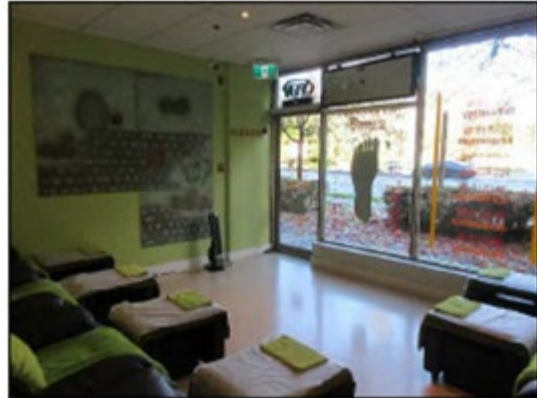
Interior view of the Subject Strata Lots