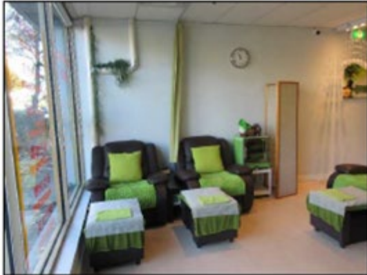
Interior view of the Subject Strata Lots