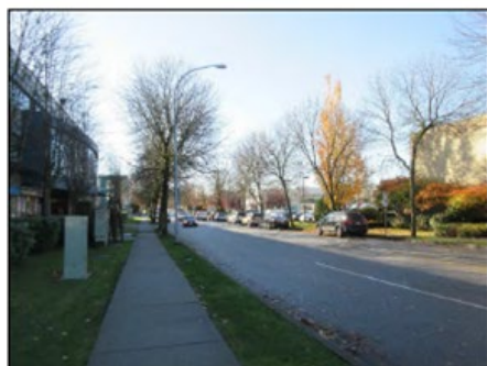
Looking south along Odlin Crescent within the immediate vicinity of the Property