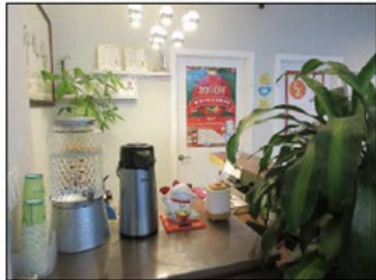
Interior view of the Subject Strata Lots