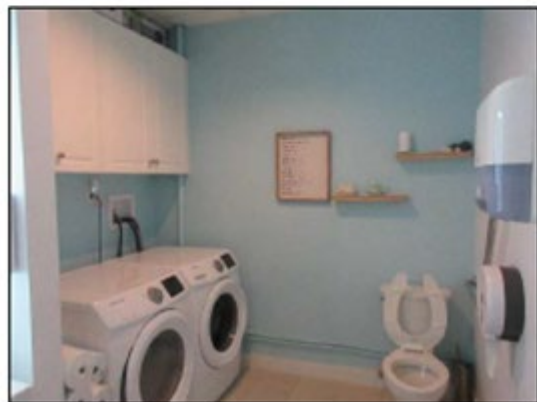
Interior view of the Subject Strata Lots