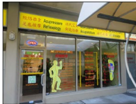
Exterior view of the strata lots