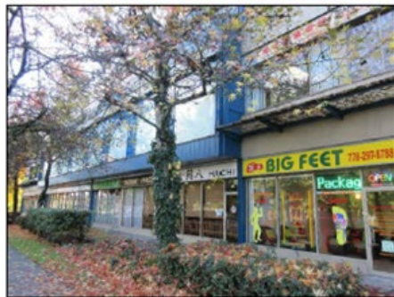
View of the subject development from Cambie Road